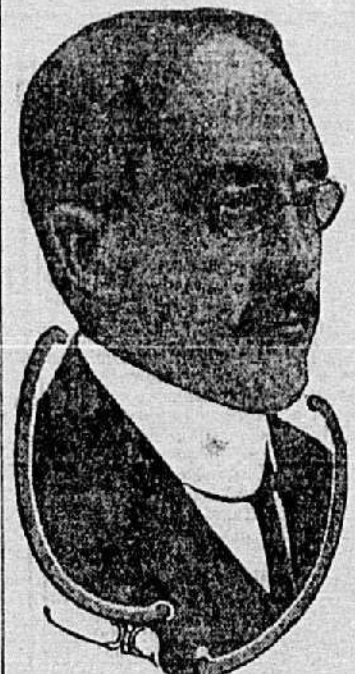
JAMES W. GERARD.